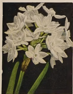
PAPER WHITE NARCISSUS

ST. BRIGID Beautiful double and semi-double flowers in a wide range of bright colors. Blooming with the tulips and daffodils, they make most attractive cut flowers as well as good border subjects. 12 bulbs $1.25; 25 for $2.75; 100 for $7.00